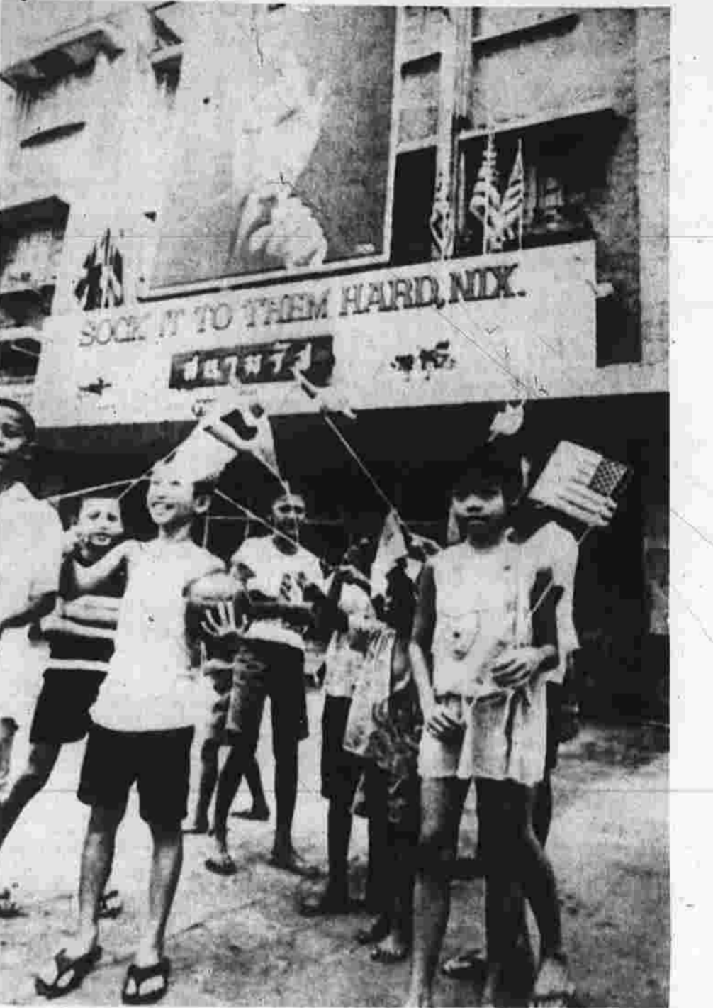
FLAGWAVING WELCOMERS —Youngsters on street in Bangkok wave American flags in welcoming President Richard Nixon. Notice sign in background.

BANGKOK (AP)—President Nixon's visit to Thailand got off to an uneasy start today with two security scares after a rain-soaked arrival. One man threw what appeared to be an empty bottle at Nixon and his King Bhumibol. Police arrested him and said he was mentally disturbed, with a previous record. Another man was arrested nearby with a pistol in his belt. But he turned out to be an army officer on leave from southern Thailand. He was released. The bottle thrower was about 50 yards from Nixon and the king as they arrived at the Phanta Pavilion in downtown Bangkok for the President to receive the keys to the city. Neither Nixon nor the king seemed aware of the incident. The army officer was arrested across the street after Nixon and the king entered the pavilion. Nixon showed no sign of concern as he went through the ceremonies and extended to Thailand reassurance about his recent accent on self-help as a necessity for Asian states. "The United States will stand proudly with Thailand against those who might threaten from abroad or within," Nixon told his hosts. Receiving a warm but politely restrained welcome, Nixon said that some treaties "can be just a scrap of paper with no meaning." The United States and Thailand are members of the Southeast Asia Treaty Organization—SEATO. (See Page Eight)